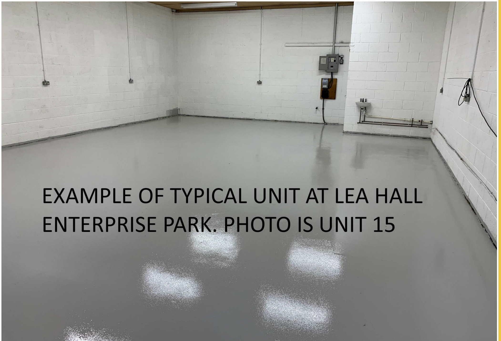
EXAMPLE OF TYPICAL UNIT AT LEA HALL ENTERPRISE PARK. PHOTO IS UNIT 15